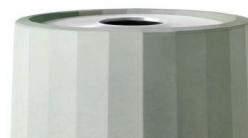
Trash Only Lid