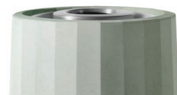
Trash & Ash Lid