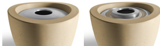
Trash Only Lid