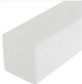
Planters are one of the applications of the recycled product.